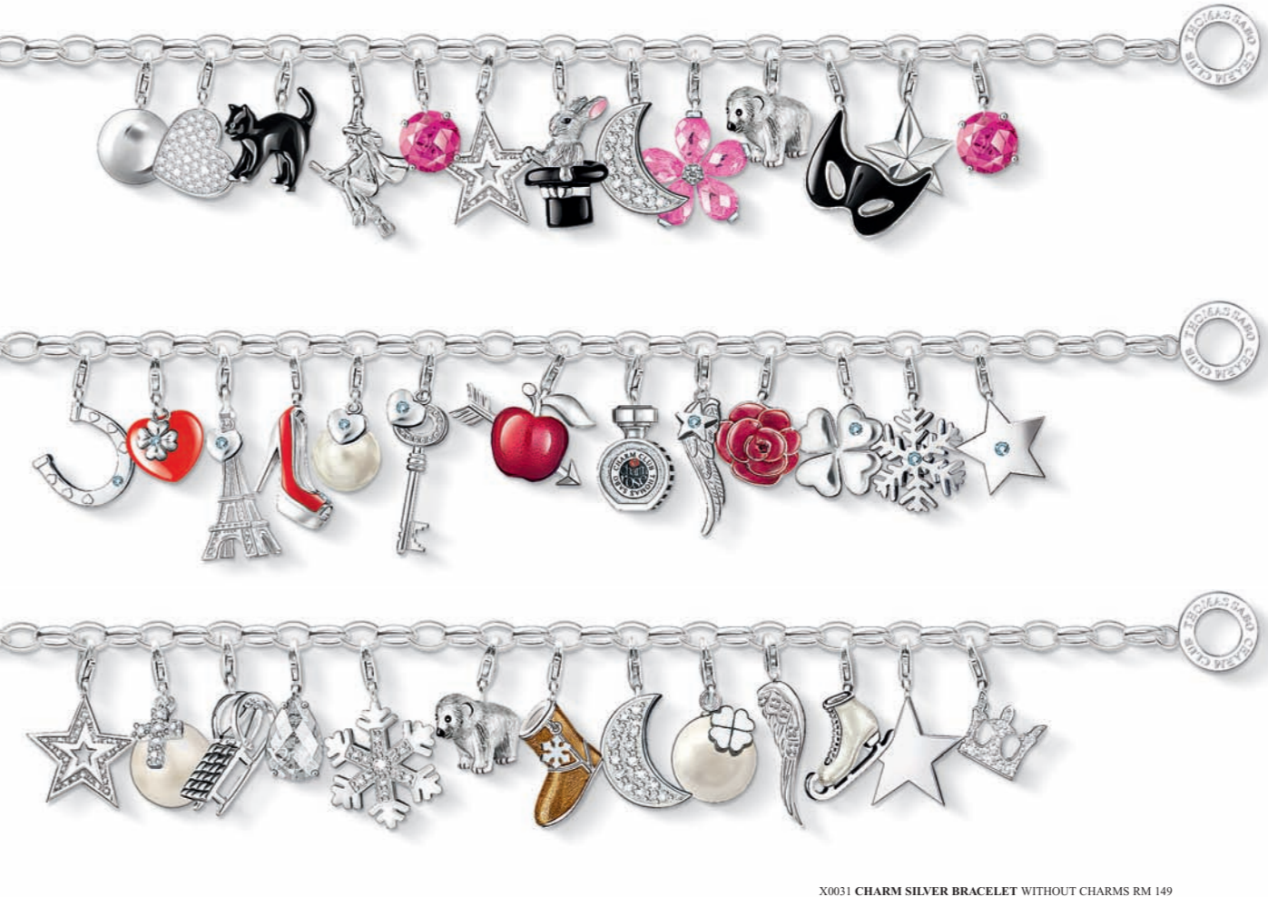
X0031 CHARM SILVER BRACELET WITHOUT CHARMS RM 149