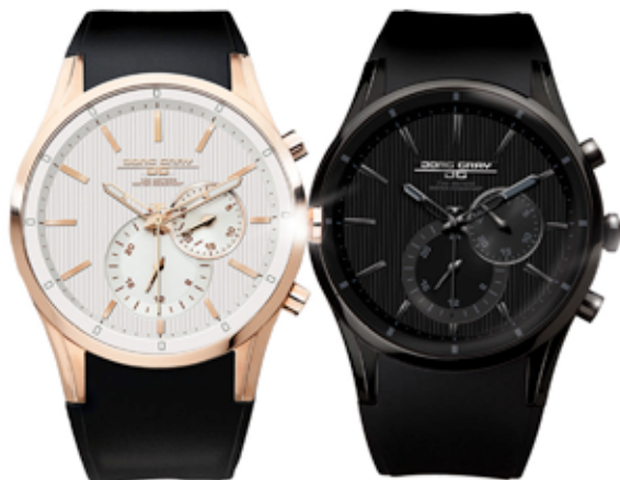
JG5100-34 (Rose Gold Plating Casing)

Delivery Charge: WM: RM5.50 EM: RM8.50 (each)