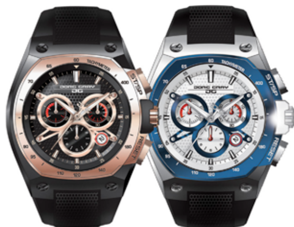
JG8300-21 (Rose Gold Plated Bezel)