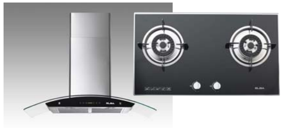
ELBA HOB EGH-8902X + HOOD COVO669/90*