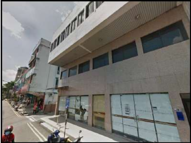
Left View of Subject Property