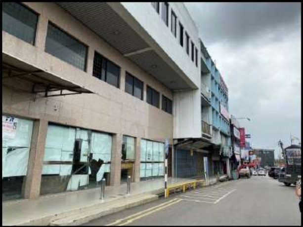
Right View of Subject Property