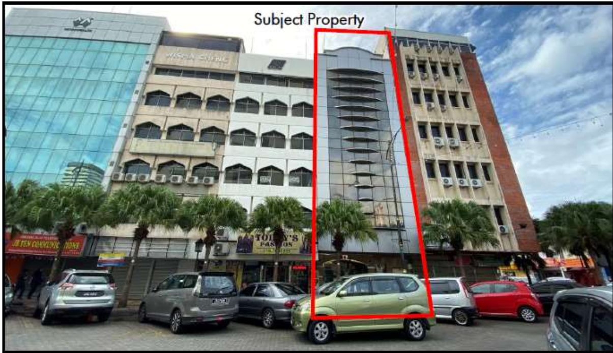
General View of Subject Properties