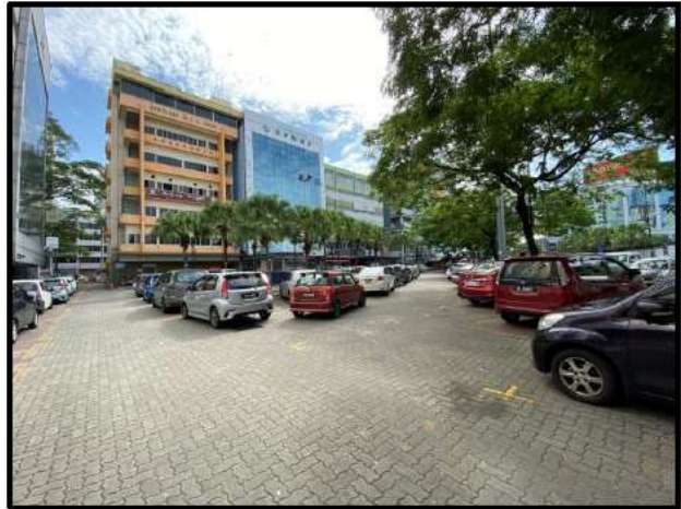
Car Park Space Behind Subject Property