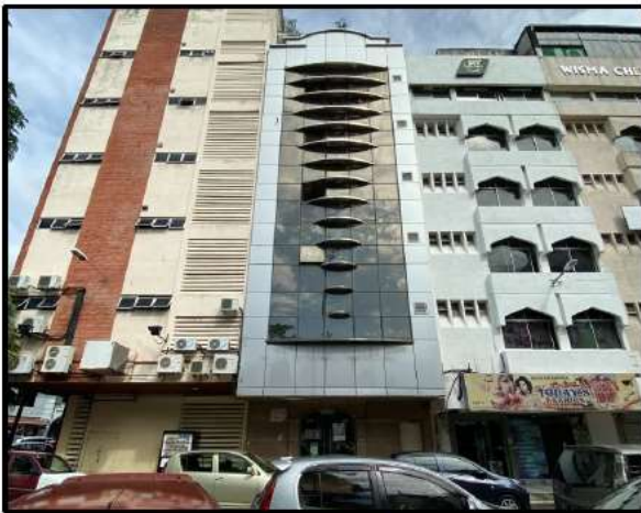
Rear View of Subject Property