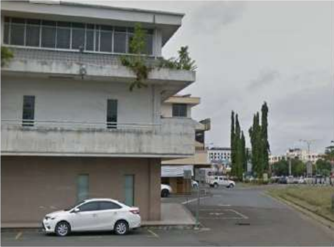
Front View and Road Access of Subject Property