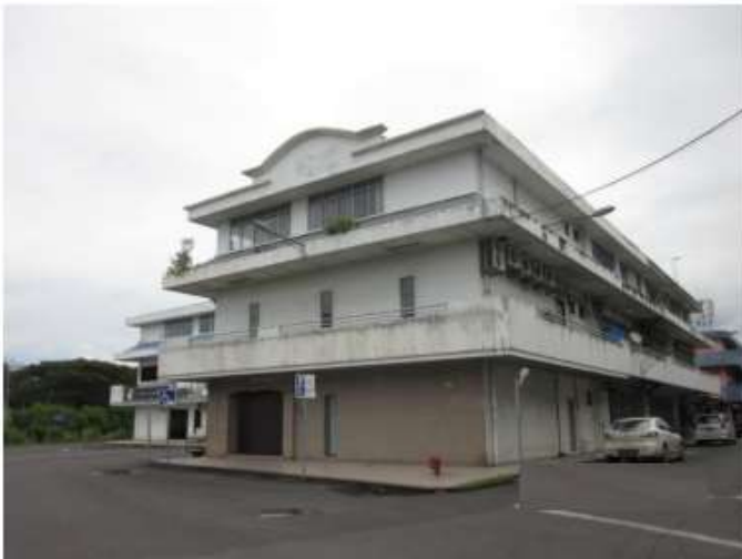
Rear and Side View of Subject Properties