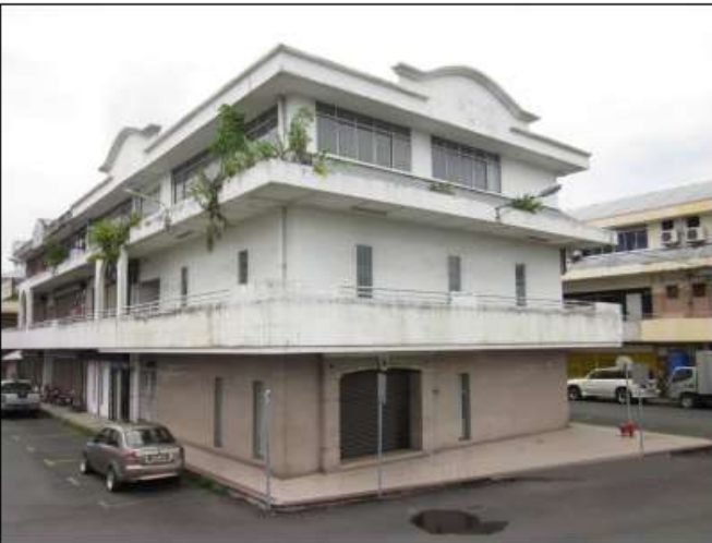
Front and Side View of Subject Property