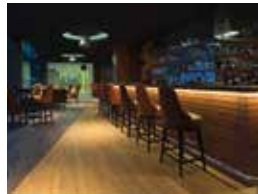
The Best Brew™