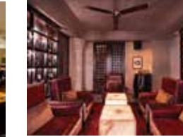
443 Bar Lounge