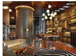
Gastro 20% off on food bill (dinner only)