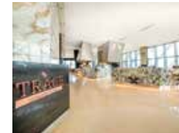
TRACE Restaurant & Bar

Find your own space in our soaring eco-friendly hotel with unparalleled city views. In the heart of Kuala Lumpur, just minutes from KLCC, lies Element Kuala Lumpur that features exciting dining options. Situated 40 floors above the ground in Element Kuala Lumpur, TRACE Restaurant & Bar is the latest sky dining venue in town that offers a stunning bird's eye view of the city. The restaurant offers a delectable variety of food options - from healthy western-fusion delights to the coolest cocktail trends.