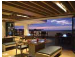
Azure Pool Bar & Café