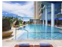
Le Méridien Kota Kinabalu

Your Maybank Islamic World Mastercard Ikhwan Card-i instantly accords you with exclusive dining privileges with SPG hotel properties. Here, you will enjoy dining benefits* at a number of highly acclaimed restaurants at all participating SPG Hotels and Resorts Malaysia. Simply present your Maybank Islamic World Mastercard Ikhwan Card-i to enjoy these privileges.